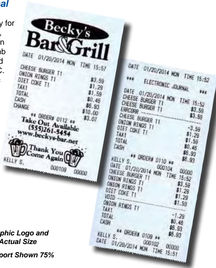
Receipt Featuring Graphic Logo and Message Shown 75% Actual Size

The journal can be archived electronically for printing at end-of-day, can be collected on an SD card or USB thumb drive, or can be polled and collected by a PC. A variety of electronic journal reports are available that allow you to quickly audit selected activities.