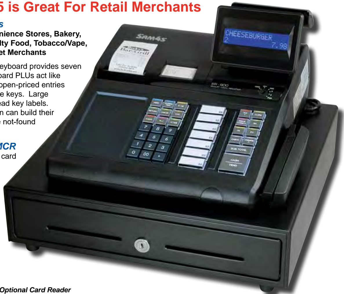
SAM4s ER-915 Shown With Optional Card Reader

Use the optional integrated card reader to swipe payment cards when integrated payment options are implemented.