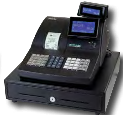
NR-510R Raised-Key Keyboard